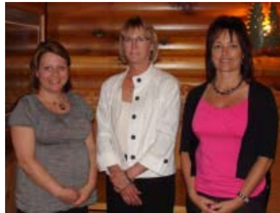
Membership Drive Top