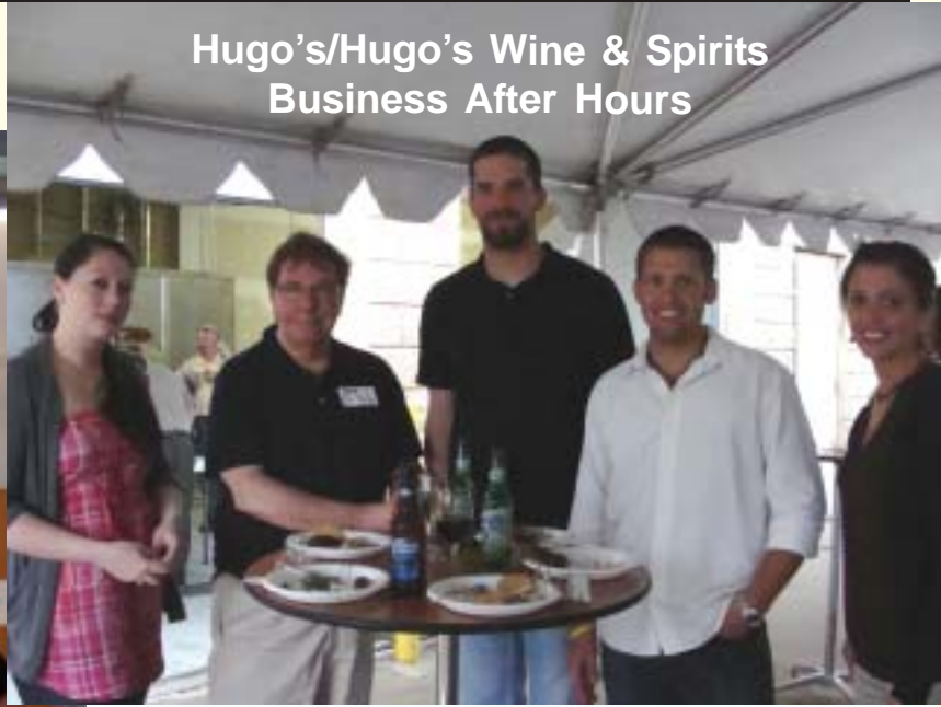
Hugo's/Hugo's Wine & Spirits Business After Hours