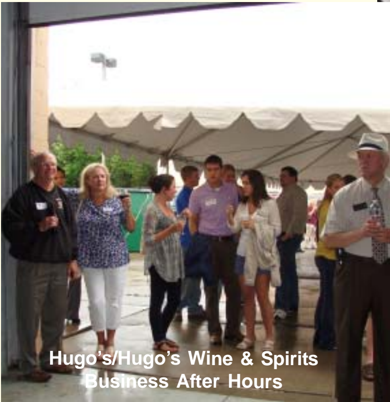
Hugo's/Hugo's Wine & Spirits Business After Hours