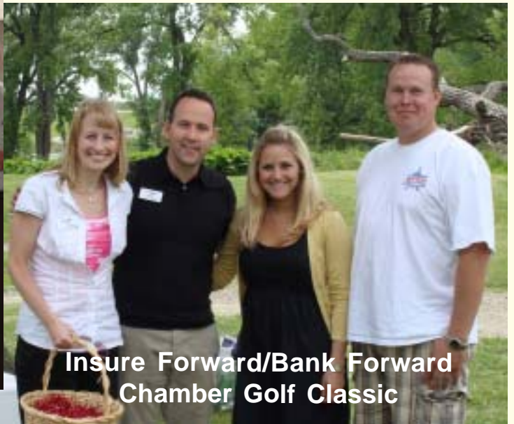
Insure Forward/Bank Forward Chamber Golf Classic