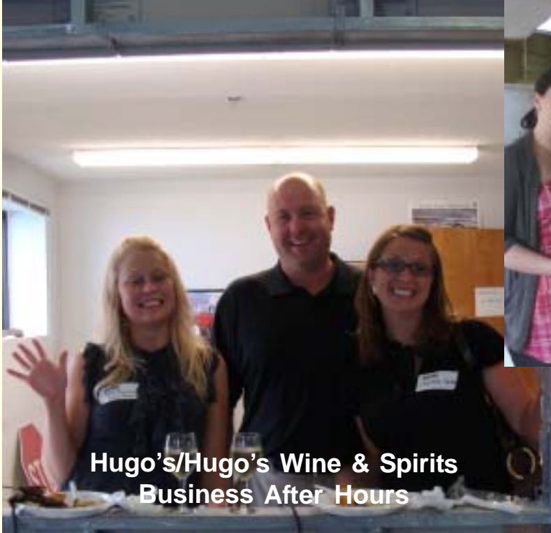
Hugo's/Hugo's Wine & Spirits Business After Hours