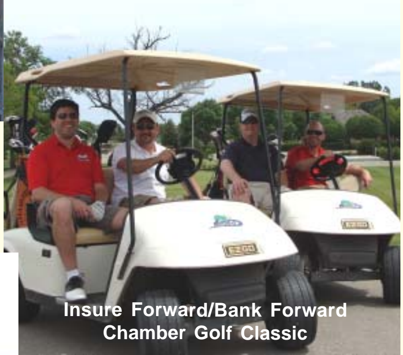
Insure Forward/Bank Forward Chamber Golf Classic