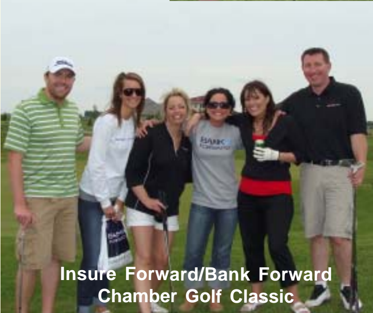
Insure Forward/Bank Forward Chamber Golf Classic